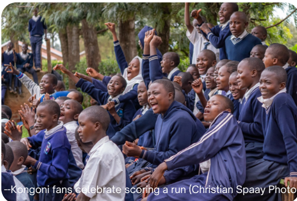
—Kongoni fans celebrate scoring a run

Our next priority is to continue to expand access to baseball on the African continent. We aim to do this by effectively distributing equipment, advancing our training efforts, and making baseball activities more feasible through our Ubuntu Fund Grant Program. We aim to accomplish these goals through both our established partnerships and blossoming relationships with key stakeholders in African baseball globally. To do each of these things, we need your support!