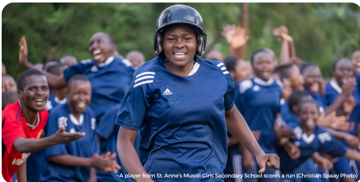
A player from St. Anne's Musoli Girls Secondary School scores a run