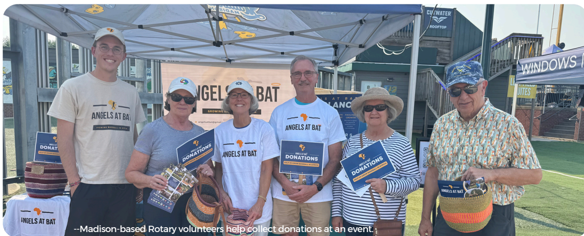
--Madison-based Rotary volunteers help collect donations at an event.