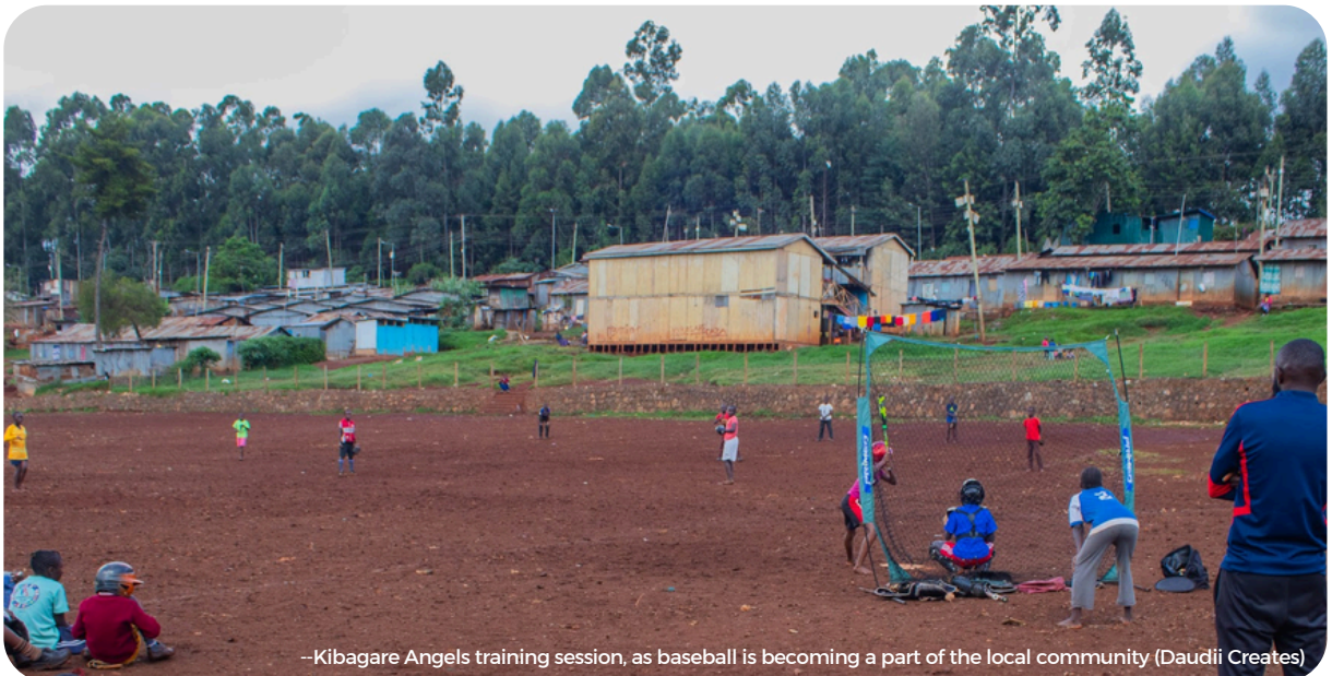
—Kibagare Angels training session, as baseball is becoming a part of the local community