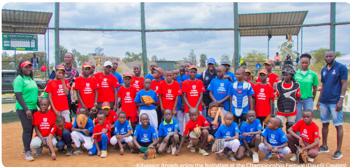
--Kibagare Angels enjoy the festivities at the Championship Festival (Daudii Creates)