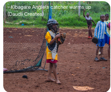
—Kibagare Angels catcher warms up

Our current system only allows for small shipments of equipment to our partners abroad. This means that each load of equipment is distributed within just a few months of the shipments arrival. The need for equipment cannot be understated because the only way for kids across most of the continent to get baseball equipment is through these donations; that is why being able to send our own shipping container is so essential. We have an estimated 20,000 pounds of equipment waiting to be sent in this container! Help us get there by donating to Angels at Bat and get us to our goal of $35,000 (QR code).